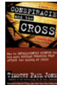
"Conspiracies and the Cross" Strang: 2008