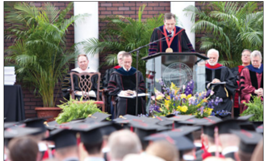
R. Albert Mohler Jr. challenges graduates to not view themselves as professionals as they embark on a life of commitment to spreading the Gospel.