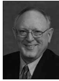
Mark T. Coppenger Professor of Christian Apologetics (2004)